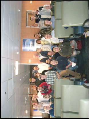
The LPD pastor's cruise group enjoying fellowship together.

• Tuesday, June 1 the LPD pastors and staff enjoyed a cruise aboard BC Ferries. This is always a time of encouragement for all who are able to attend. Our theme was 'leaders who shepherd: shepherds who lead.' As well, we heard from a few of the pastors of how God is leading in their lives and churches. Encourage your pastor to attend this uplifting event!