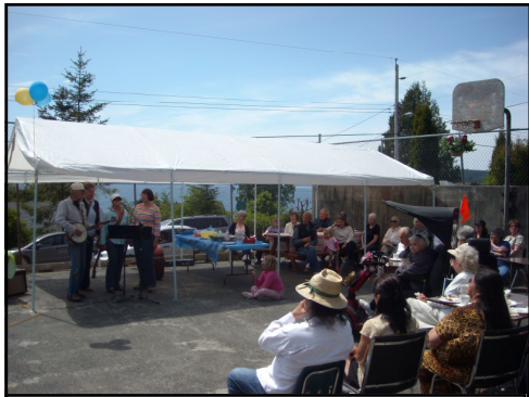
Outdoor celebration at the Sointula 50th anniversary.